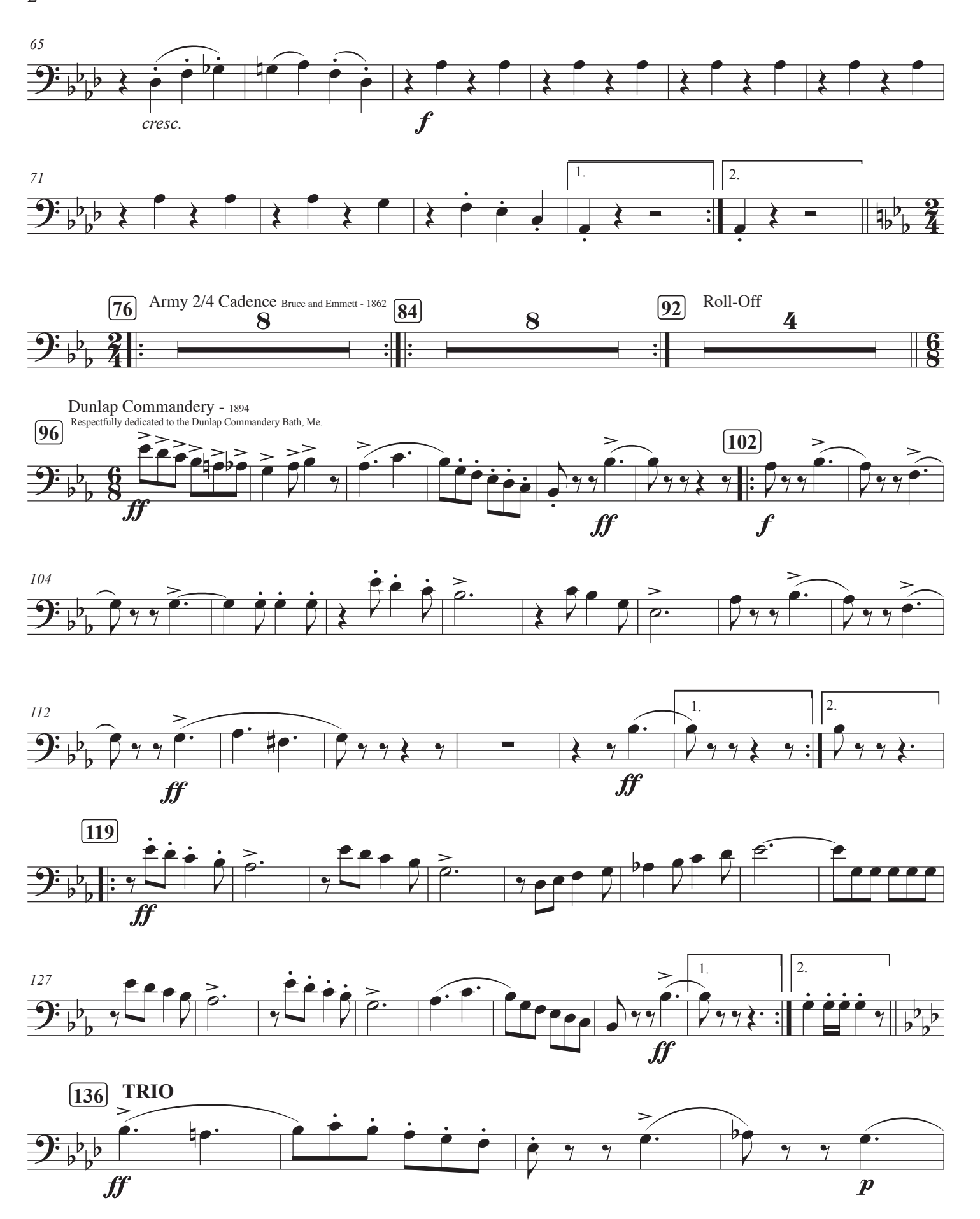
Trombone 2 p. 2